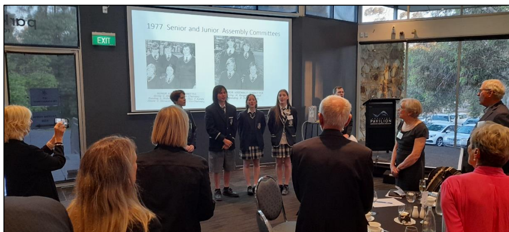
Students led the school hymn.