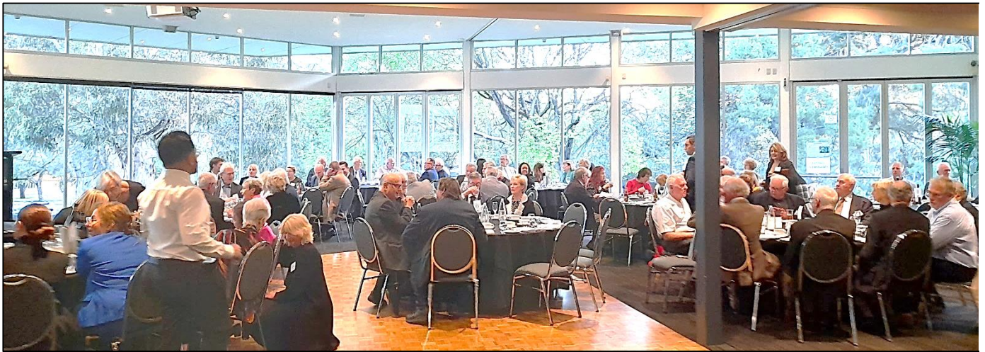
100 People attended. The view was beautiful and the music spectacular!